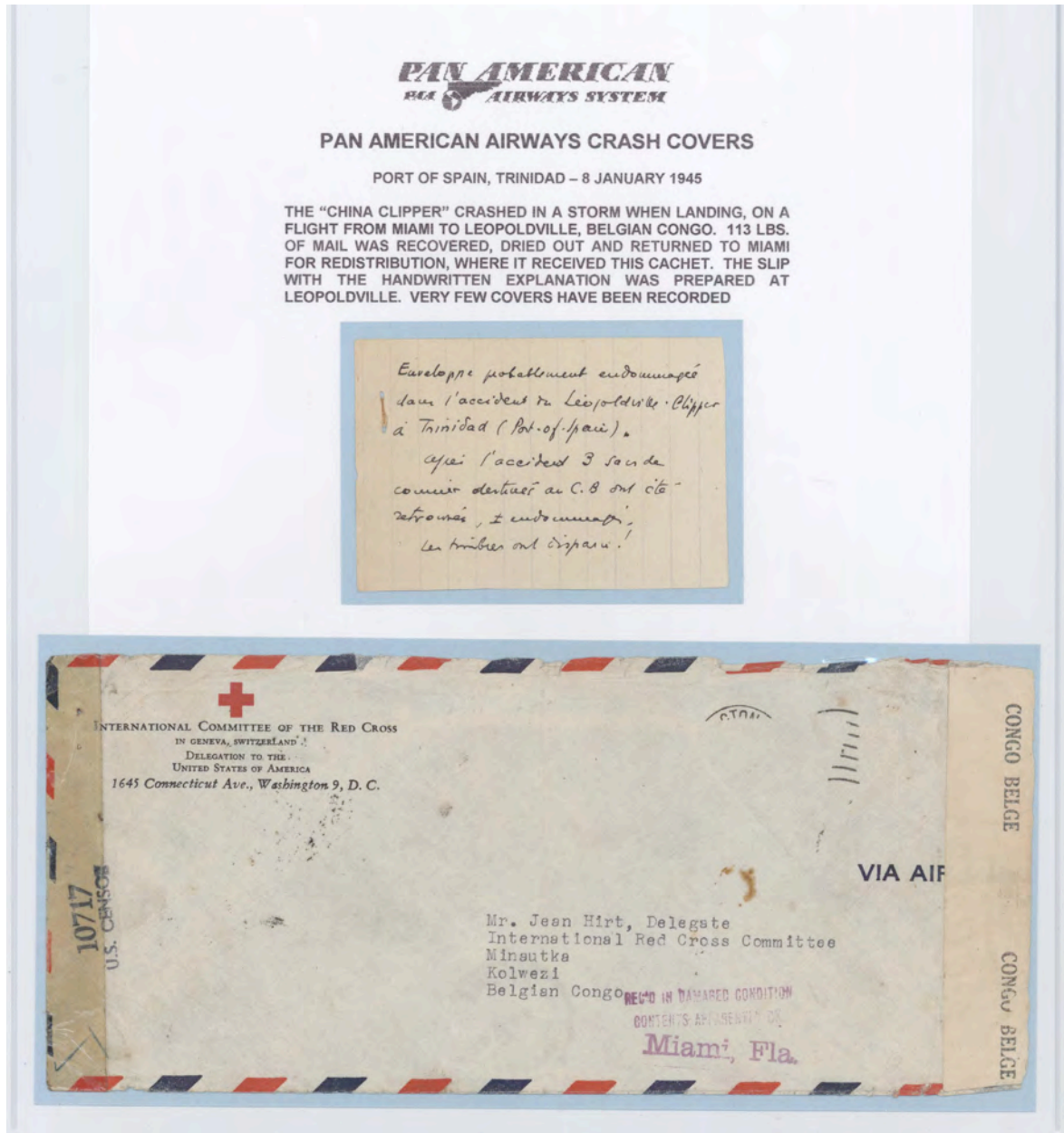
This envelope in Ken Sanford's collection is one of only three letters recovered from the crash of the famous China Clipper off Trinidad in 1945.