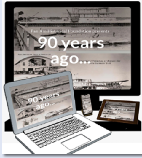
CROSS PLATFORM ACCESS: THE PAN AM DIGITAL MUSEUM WILL BE AVAILABLE ON VARIOUS DEVICES

archived film elements that had never been included in finished productions, as well as items such as newsreels.